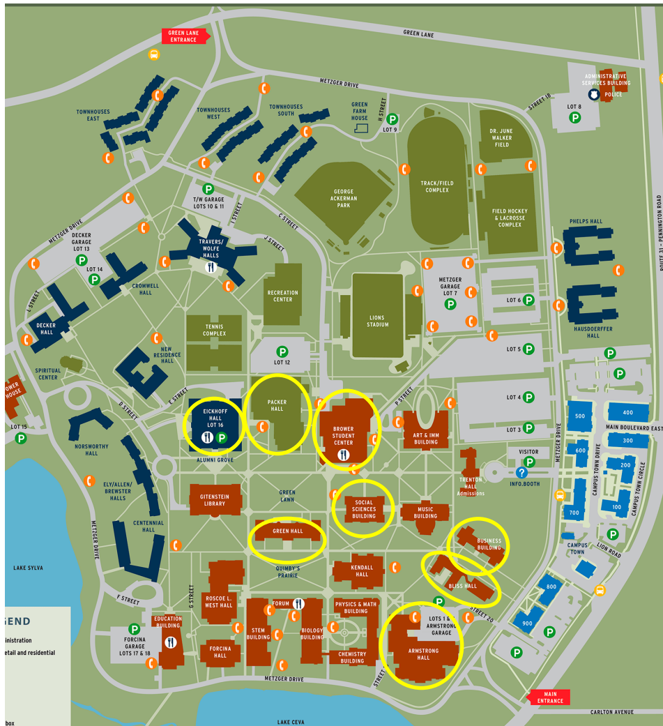
TCNJ CAMPUS MAP

2025 National TSA Conference June 27 - July 1, 2025 · Gaylord Opryland · Nashville, TN “Tune In To Technology”